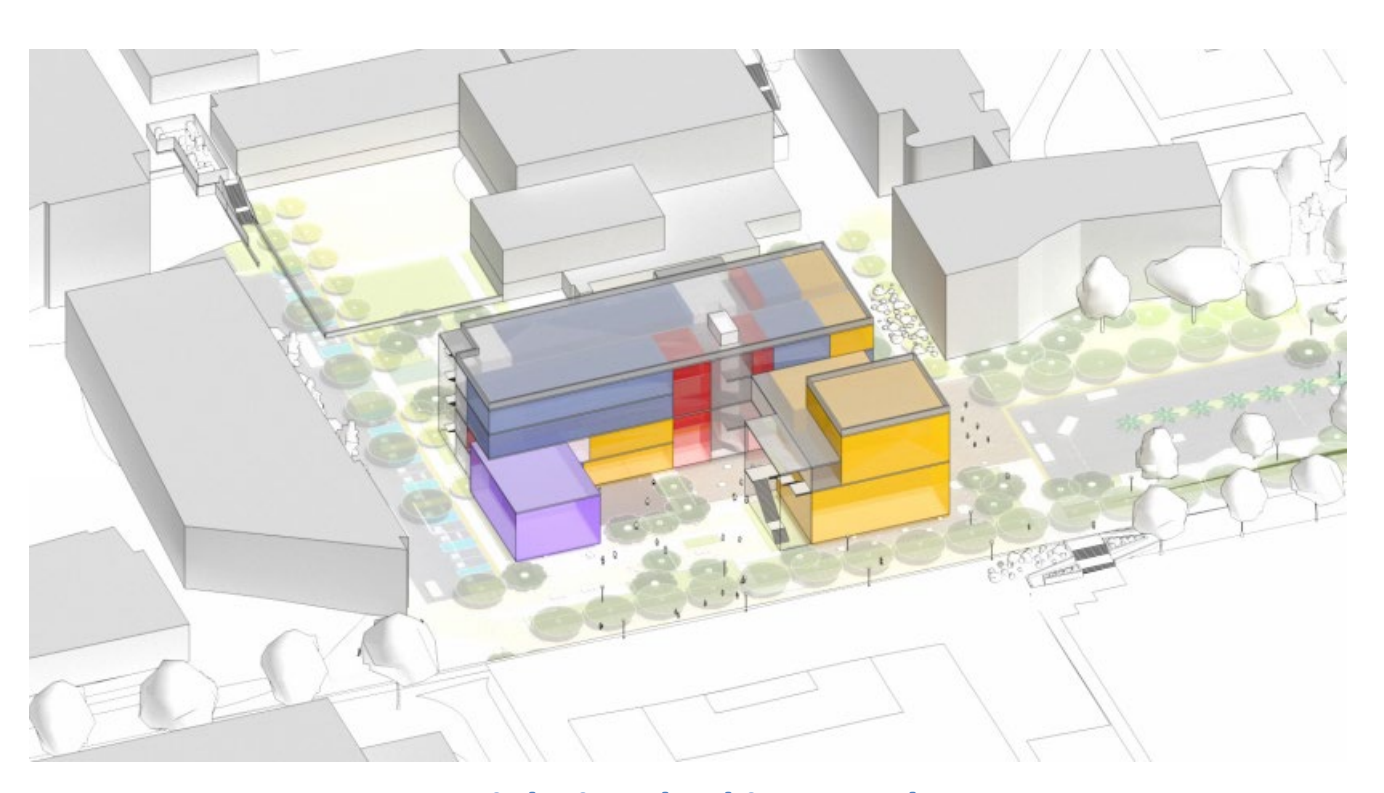
Gateway Passage - Aerial View looking South-West