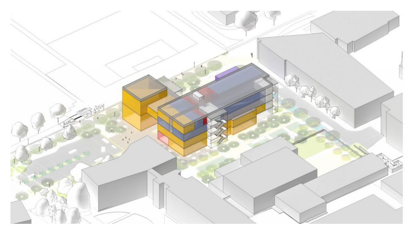
Gateway Passage - Aerial View looking Northeast